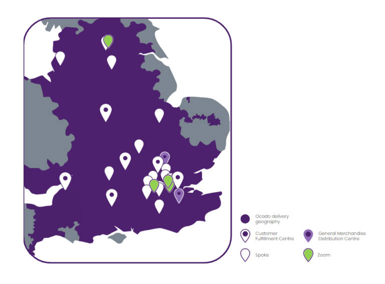
Figure 1: Ocado Retail Coverage Map

We do not have international operations.